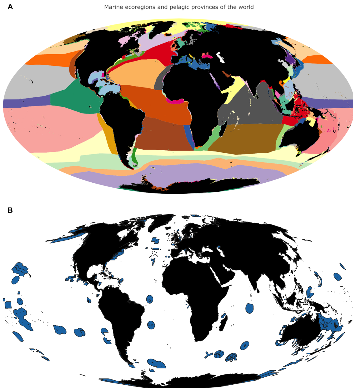
Fig. 3. Coastal ecoregions, pelagic provinces, and marine protected areas of the world oceans. (A) Coastal ecoregions and pelagic provinces. (B) Map of marine protected areas.

population (72), and management of this habitat could be supported under the OECM umbrella as megafaunal landscapes in that part of the breeding tiger population, especially in India, that occurs outside formal protected areas. The payoff for climate stabilization is dramatic: An earlier study showed that forested areas that contain tigers have three times the carbon density compared to forests and degraded lands where tigers have been eradicated (71). Restoration in tiger habitat and other megafaunal landscapes could center on protecting remaining fragments of natural habitat, reconnecting and buffering them by restoring degraded lands, thus aligning with the Bonn Challenge that seeks to restore 350 million ha of forest by 2030 (73). The same rationale could be used to extend protection in high-carbon density